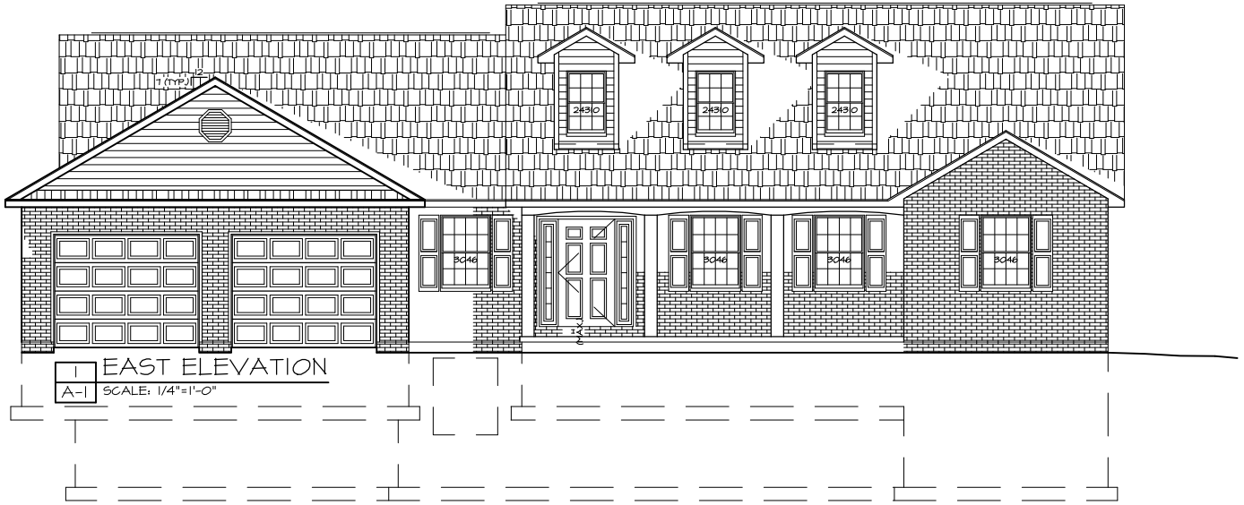
EAST ELEVATION SCALE: 1/4"=1'-0"